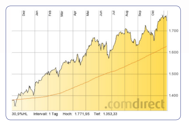
Figure 1: S&P500 1 year performance

The gold price is still stuck slightly above US$1300 per ounce. Gold recently lost its position as a safe haven with prices well in bearish territory. An outbreak above the 200-day moving average (orange line) would change the setup and bring gold back to bullish territory with a likely rally up to US$1700 per ounce or even higher. On the other hand, a further drop is likely. Risk averse investors should wait until the gold chart comes back into bullish territory, underpinned by the rise of investors' confidence in gold and gold mining stocks.