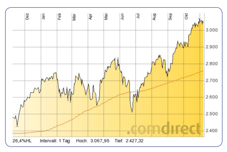
Figure 2: EuroStoxx50 1 year performance