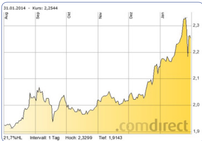
Figure 3: Exchange Rate USD/Turkish Lira