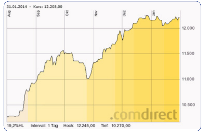
Figure 4: Exchange Rate USD/Indonesian Rupiah