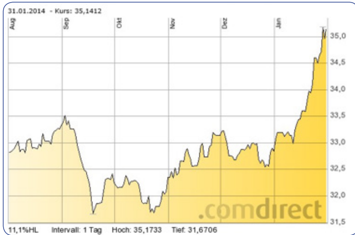
Figure 2: Exchange Rate USD/Russian Ruble

to profit from it. You can also contact us directly via office@shorelinebrokers.com or telephone number +7 495 956 0473.