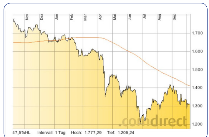
Figure 3: Goldprice 1-year Chart