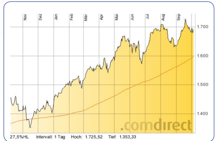
Figure 1: S&P500 1-year Chart

Gold recently lost its position as a safe haven with prices well in bearish territory. After an incredible rally since the year 2000 from US$250 per ounce to US$1900 in 2011. During the last year, the price fell from US$1770 to a price of around US$1300. Gold mining stocks were hit even harder with some stocks losing 90% of its value. For risk loving investors, this can be a unique moment to invest into gold and other precious metals mining stocks. Investors should be warned, a drop in gold price to US$1000 is highly