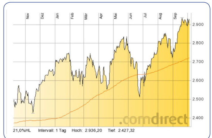
Figure 2: EuroStoxx50 1-year Chart